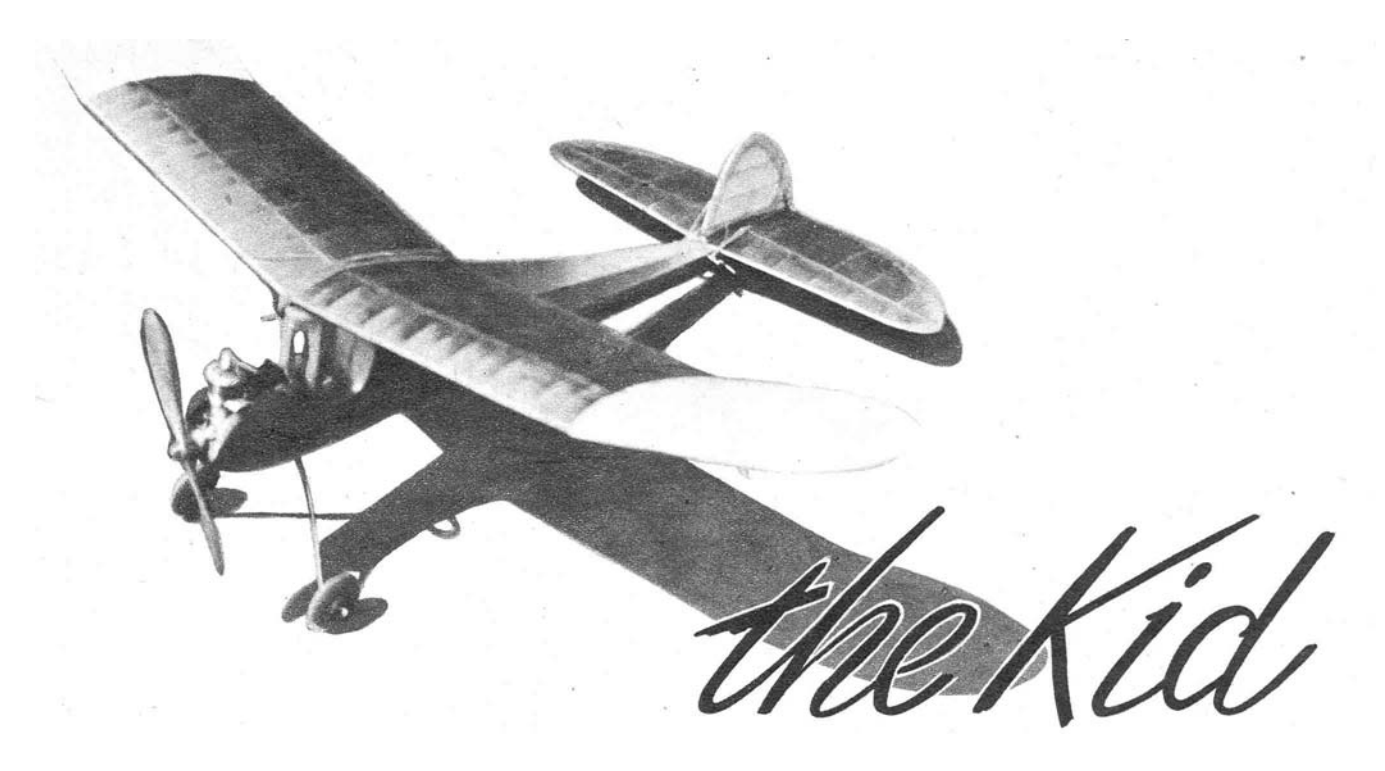
by ART HORAK