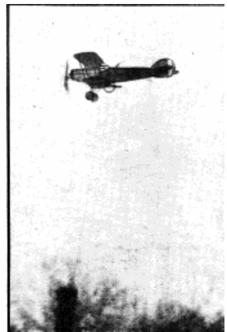
Though it is only sixteen inches in span, it makes fine flights