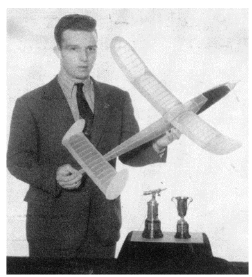
Light, simple construction, single-blade propeller and efficient stable design makes this plane supreme as a contest winner