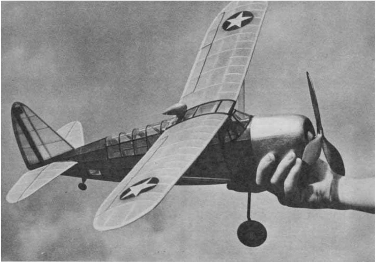
Tops in adaptability for a flying model is this neat army observation plane. Good proportions make it sensational flier. Good design simplifies construction.